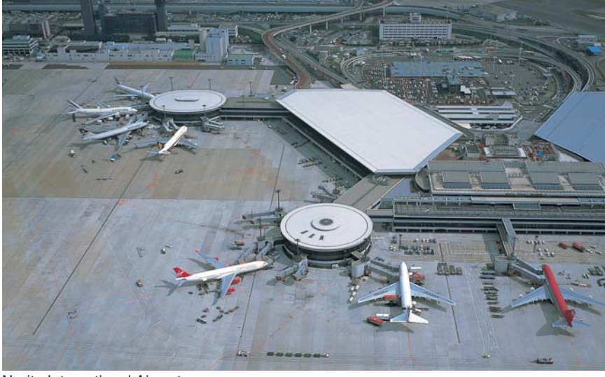
Narita International Airport