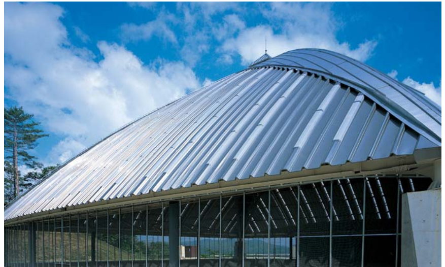
Sports facility, with toplight specification

* Gantan Yuko System, steel frame specification, mesh specification