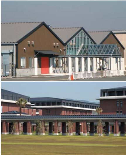
Gantan Toplights Toplight strip specification, integrated into the roof

CONTACT : GANTAN BEAUTY INDUSTRY CO., LTD. International Business Department E-mail : overseas@gantan.co.jp Phone : +81-466-43-2187 / Fax : +81-466-45-3037 URL : http://www.gantan.co.jp/english/index.html