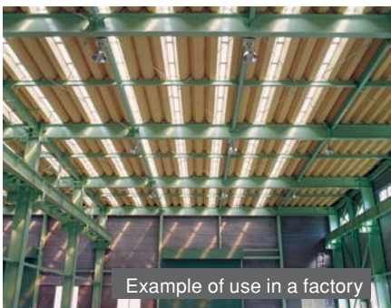
Example of use in a factory

The wide light-trapping area brightens the factory interior, saving energy!