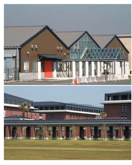
Gantan Toplights Toplight strip specification, integrated into the roof

Phone: +81-466-43-2187 / Fax: +81-466-45-3037 URL: http://www.gantan.co.jp/english/index.html