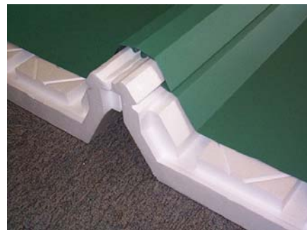
* Contact us for details