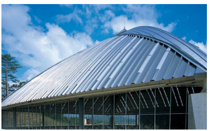
Sports facility, with toplight specification

* Gantan Yuko System, steel frame specification, mesh specification