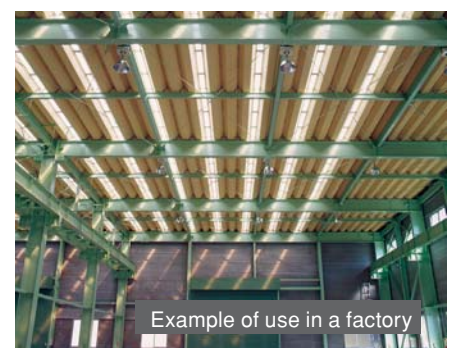
The wide light-trapping area brightens the factory interior, saving energy!